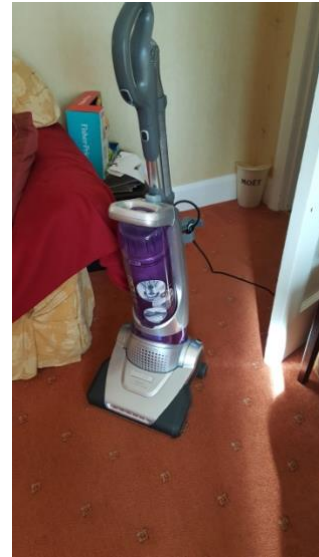
Image 3: "Vacuum cleaner; again, I guess the old image of the woman doing the housework" (Julie)