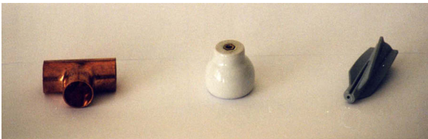
Fig. 1. One of the triads of objects used in the different experiments of this study. Which two objects were given which names was counterbalanced across participants.

After the presentation phase, the experimenter tested categorization by putting one object of the named pair in his own hand, placed at an equal distance from the remaining two objects, and asking the infant to give him “the one that goes with this one”. While waiting for the response, the experimenter looked at either the infant’s face or the object in his hand to avoid influencing the infant’s response. As soon as the infant had picked up an object, the other object was discreetly removed from the infant’s reach and positive feedback was provided regardless of the choice made. Successful performance corresponded to the selection of the similarly labeled object.