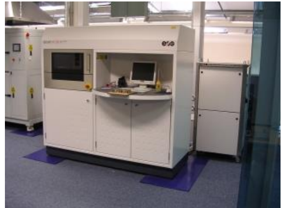
Figure 1 Rapid manufacturing facilities of the IPDC

The significant investments that have been made in “time compression technologies” e.g. computer-aided design (CAD), computer aided manufacture (CAM), and rapid prototyping, reflect a commitment to rapid product development practice (Figure 1). Through the IPDC the entrepreneurial SME can access the facilities to support their product development project at minimum risk to the company and zero investment on their part in the technology. For example, the development of CAD models of design concepts can quickly lead to prototype parts being made in the Centre’s rapid manufacturing facility – these prototypes allow for an early evaluation of design concepts and enable the “proof of concept” stage to be delivered quickly and effectively (Figure 2).