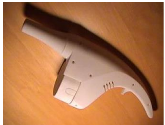
Figure 2 CAD modelling (left) leading to rapid prototype parts for proof of concept (right)

From a regional perspective, public money has been used to invest in expensive capital items. In some cases, the technology is well beyond the reach of our SME clients to afford. However, the