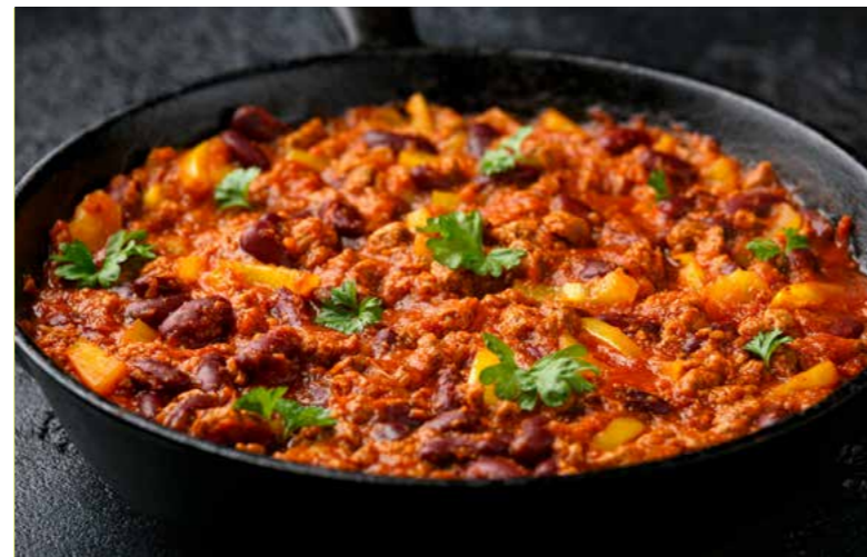
Red meat replacements include plant based meat alternative proteins such as pea or soy based mince.

Dietetics specifically are already showing bold visionary leadership and are well placed to push the boundaries of collaborative leadership on this agenda. Food waste in hospitals is a catastrophic environmental issue in the UK (Wrap, 2021) and is being collaboratively tackled as part of the NHS net zero strategy. Dietitians are ahead of the game in the green agenda (in education and professional practice contexts), whereas other professional disciplines have further to go. This needs to be seen as a catalyst for the dietetic profession. The BDA are already engaging their membership in the UK via shared practical resources (e.g. One Blue Dot) and AHP greener hub. Dietitians now need to step into their role as leaders and educators of other AHPs to promote sustainable diets and food systems within broader healthcare contexts. Such collaborative and supportive leadership will boost confidence and enhance the capacity for environmentally sustainable healthcare at scale.