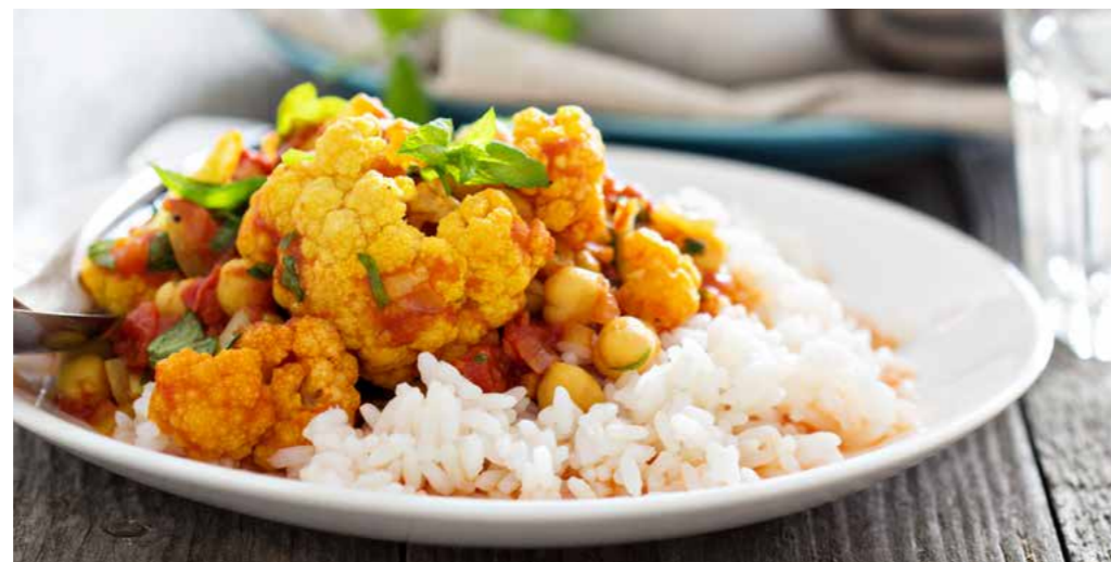
Seasonal, locally grown produce

human resources'. Translating and communicating what a sustainable diet looks like 'on a plate' is difficult however, even for nutrition professionals. This could potentially be supported by the introduction of professional standards in the area.