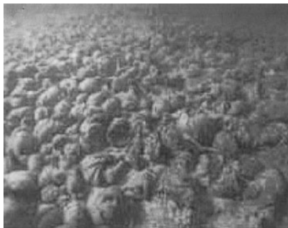
Figure 3. Crepidula fornicata overgrowing maerl in the Bay of Brest.

The slipper limpet Crepidula fornicata was accidentally introduced to France sometime between the 1940s—60s along with oysters for aquaculture. This calyptraeid gastropod has since spread along the whole Channel-Atlantic coast of France (De Montaudouin et al. , 1999). In shallow bays, it can completely smother the sediment creating beds with several thousand individuals per m 2 (Figure 3). Thouzeau et al. (2000) described Crepidula grounds as a separate biotope with its own characteristic community. Dense aggregations of C. fornicata trap suspended silt, faeces and pseudofaeces which alter the specific composition and structure of benthos (Chauvaud et al. , 2000). Live maerl thalli become covered in Crepidula and the interstices of the deposit become clogged with silt; this kills the maerl thalli and