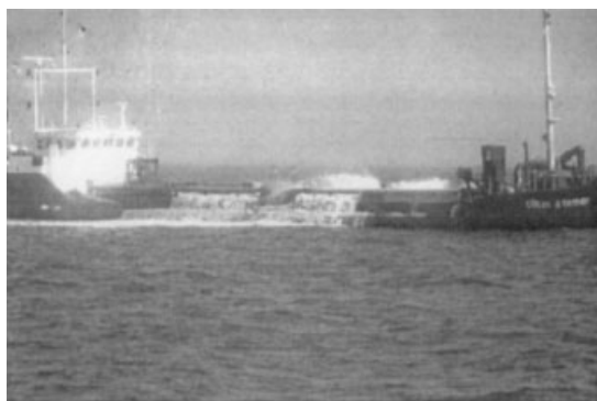
Figure 1. The Côtes d'Armor ; a maerl extraction dredger in use on the Glenan maerl banks in SW Brittany, June 1997. Note the suspended sediment that is washed overboard.

1950) and 86.22 \pm 0.39 modern ^{14}\text{C} enrichment. The subsurface thalli (code AA-49821) had a conventional radiocarbon age of 5862 \pm 57 years BP and 48.2 \pm 0.34 modern ^{14}\text{C} enrichment (errors all \pm 1\sigma level for overall analytical confidence). Thus the 10 m thick Glenan maerl bank has been slowly accumulating over much of the Holocene.