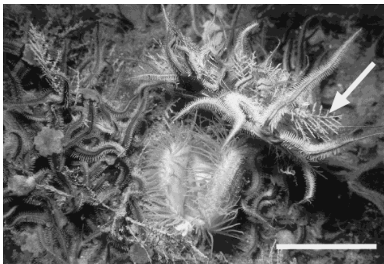
Figure 2. Adult L. hians (bottom centre) emergent from a nest at –15 m Creag Gobhainn, Loch Fyne, October 1999. The nest surface is covered in attached hydroids (arrow) and vagile brittlestars. Scale bar = 3 cm.

Step (1927) interpreted Limaria nests as providing protection against predation by cod, which, he wrote, 'have a weakness for Lima flesh'. That being the case (cf. Côté, 1995 and Reimer and Tedengren, 1997 on Mytilus ), the feeding activities of shoals of juvenile cod noted on the surface of Limaria reefs (Figure 4) might naturally enhance byssal production and thereby strengthen nest defences. However, a few apparently healthy L. hians were occasionally seen outside their protective byssus nests (Figures 1 and 2),