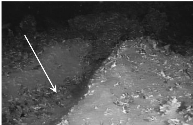
Figure 2. Trawled L. pertusa grounds at a depth of 200 m in the Iverryggen area, West Norway, May 1999. Smashed coral fragments litter the sediment around a clear trench from towed fishing gear (arrow). Lower edge of photograph ca. 1.5 m.

organisms, ever since. For example, anthropogenic ^{14}\text{C} enrichment is clearly evident in L. pertusa from 300 m in Trondheimfjord, West Norway (Mikkelsen et al. 1982). Other sources of anthropogenic ^{14}\text{C} , such as from the Selafeld nuclear fuel reprocessing plant, have also entered organisms in shallow waters around the Northeast Atlantic (Cook et al. 1998). The low-percentage modern ^{14}\text{C} for live L. pertusa from the West Ireland continental shelf break indicates negligible contamination by anthropogenic ^{14}\text{C} . This suggests that radiocarbon levels in these corals were influenced by waters that had not been in contact with the ocean surface since the 1950s. This ties in with oceanographic data that reveal the influence of older waters below 1000 m on the West Ireland continental shelf break (New & Smythe-Wright 2001). We estimate that the concretions of D. cristagalli that had been broken from the reef by trawling were at least 4550 years old. This evidence adds to mounting international concern over the unprotected fate of these deep-water coral habitats (Rogers 1999; Duncan 2001; Koslow et al. 2001).