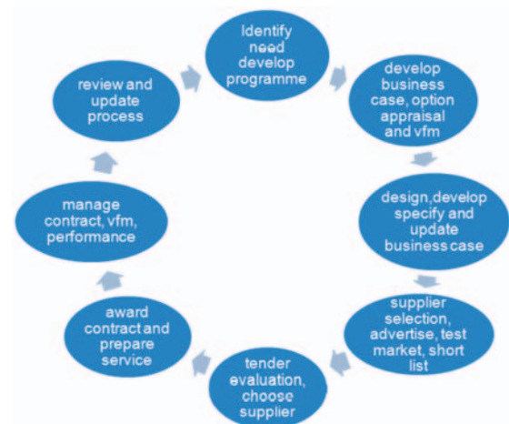
Figure 2. The procurement cycle. Adapted from: I&DeA National procurement strategy: Sustainability for Local Government 2003 [8], www.local.gov.uk .

Senior managers were keen to make sustainability a central focus of procurement but reported that internal systems to enable them to do this were not well coordinated and external pressures exist over which they have no control. Participants reported having to adapt (sometimes conflicting) legislation to the local situation. For example, infection control which requires items to be for single use only can conflict with waste management policies which attempt to reduce, re-use and recycle. Participants also suggested that organizational processes were often not consistent with working practices that attempted to embed sustainable solutions in purchasing throughout organizations. These issues, if left unaddressed, will eventually stifle health and social care organizations already struggling with economic pressures, inadequate buildings and pressures on space. Although the participants reported obstacles to sustainable procurement, they were also very willing