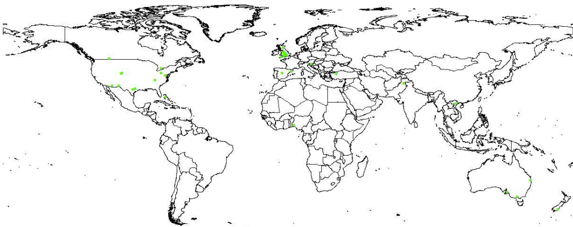
Figure ????: Geographical locations of UK interview respondents