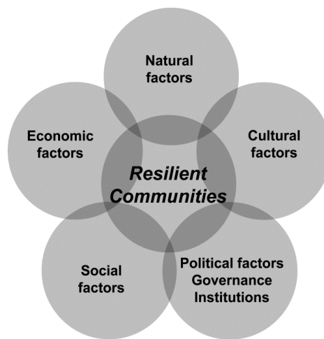
Figure 1: Conceptual framework for analysing community resilience

Both Emery and Flora (2006) and Kelly et al. (2015) suggested that the resilience of human systems can be best understood as the interplay between social, economic, cultural, political and environmental dimensions as well as the capacity of each to respond and adapt to change 1 (Figure 1). In this sense, resilient human systems are generally found where these dimensions or ‘domains’ are strongly developed (e.g. strong social ties, strong and diversified economy, evidence of cultural pride/strong social memory, inclusive governance systems and a well-managed environment). In vulnerable systems one or several of these domains are poorly developed (e.g. weak social ties, monofunctional economy, lack of cultural pride/weak social memory, non-inclusive governance structures, poorly managed environment). There is, nonetheless, debate about the relative importance and contribution of each dimension to resilience, given the variety of human systems that exist (Kelly et al., 2015).