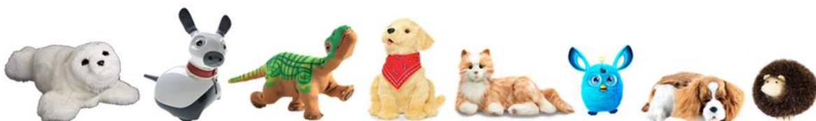
Fig 1. Eight robot and toy animals used in stage one

A range of robots and alternatives were used (Fig 1).