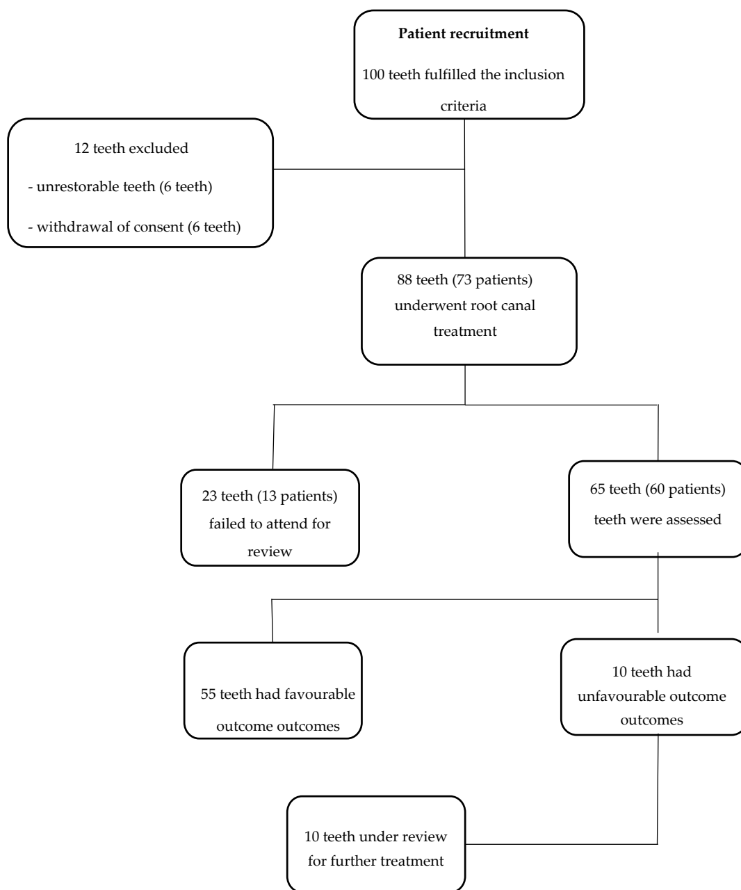
Figure 1. Flowchart of the trial showing the process of patient recruitment, exclusion and follow-up.

There were 10 teeth recorded as having an unfavourable outcome when assessed with CBCT (15.2%) and six teeth by PR (9.2%).