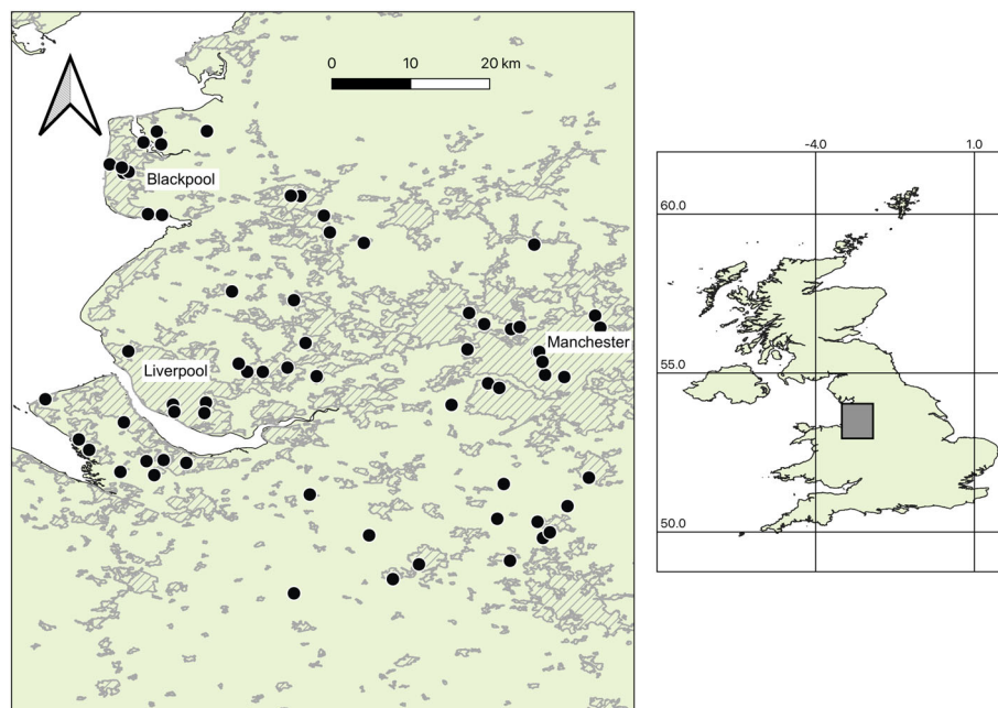
FIGURE 1 Map of the study area in North West England with location shown as a grey box on the inset map of the United Kingdom. Colonies are shown as black dots and urban areas as hatched grey. The UK layer was downloaded from map.igismap.com and the urban layer (showing built areas in December 2011) from geoportal1-ons.opendata.arcgis.com .

Studying multiple colonies across a region can help us to understand the variables that influence the honeybee microbiota, for example, the effect of different land use types on the honeybee gut microbial community (Engel et al., 2016). Land use can be a proxy for floral composition (Kleijn & Van Langevelde, 2006) and potentially for other environmental factors such as exposure to pollutants (Botías et al., 2017). Land-use change is also thought to be a major factor in bee decline (Potts et al., 2010), and land-use per se has been shown to influence gut microbiota composition in other systems (Teyssier et al., 2018). Exploratory work has found a link between land use and the bee bread microbiome (Donkersley et al., 2018), but there is little knowledge of how land use affects the bee gut microbiota. Host genotype has also been shown to shape host microbiotas in some systems (Griffiths et al., 2019; McKnite et al., 2012; Zoetendal et al., 2001). This may be particularly important for honeybee colonies because the majority of workers in a colony are related to the queen, although as honeybee queens are promiscuous, workers are not always full siblings (Estoup et al., 1994). Furthermore, haplodiploidy in honeybees