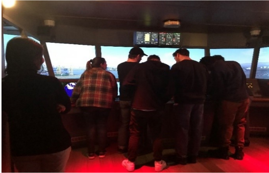
Figure 3: One group of participants in the full bridge simulator

The second scenario involved a more dramatic and sudden incident than the first. Occurring during an inbound passage to port, participants were timed to see how quickly they would detect the loss of rudder control. Even with fast detection (within seconds) the scenario was designed so that a collision was assured Tam et al. (2022).