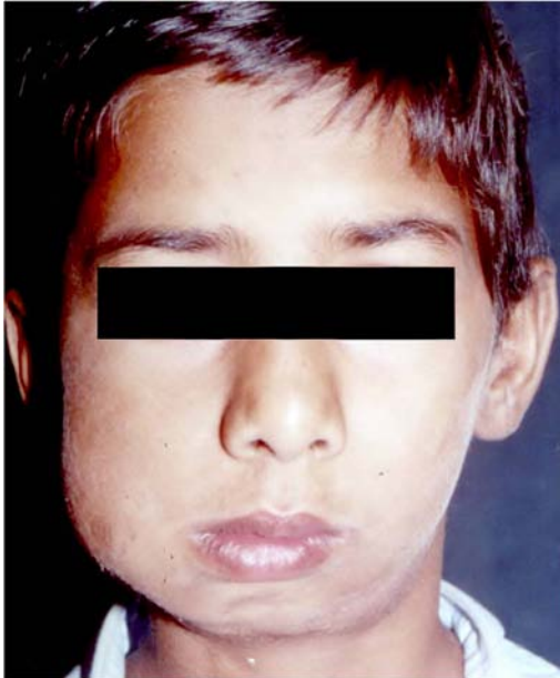
Fig. 1 Preoperative frontal view showing a swelling on the right mandible.

A 13-year-old male was presented with complaints of recurrent pain and swelling in his right lower jaw. There was a history of recurrent toothache in his right lower jaw with frequent discharge of pus for the last two years. There was no history of trauma or any surgical intervention to his lower jaw. His medical history was remarkable with no systemic disease or known allergy.