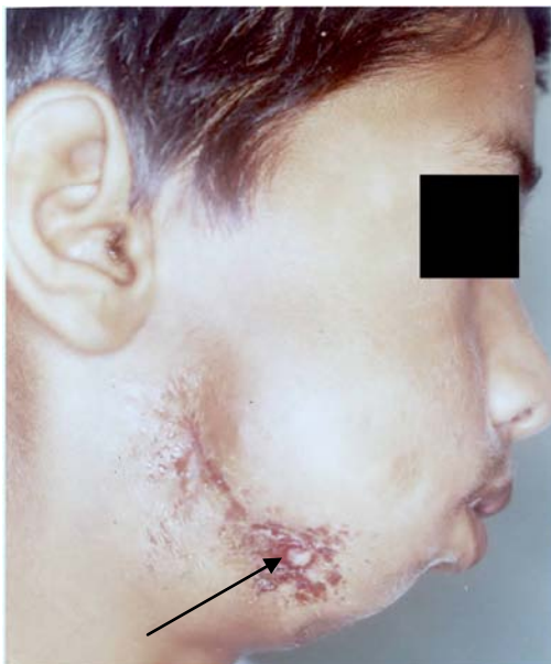
Fig. 2 Preoperative lateral view showing a cutaneous sinus with exposure of the lower right second premolar.

On extra-oral examination, a marked swelling was noted involving the right side of the mandible and there was evidence of cutaneous scarring due to recurrent discharge of pus (Fig.1 and Fig.2). There was cutaneous exposure of a bony hard tooth-like mass in the right mandibular body area. There was no regional lymphadenopathy and mouth opening was adequate. Intra-oral examination showed a retained, carious right second primary molar while the second premolar and second permanent molar were not visible on the right side. The left lower premolars, first and second permanent molars were erupted.