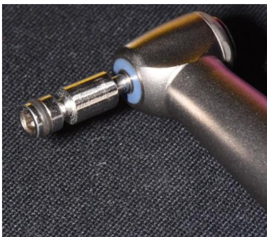
Figure 2: Application instrument with metallic shaft sleeve