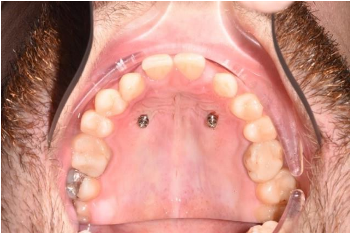
Figure 4: Postoperative view after guided insertion of OMS