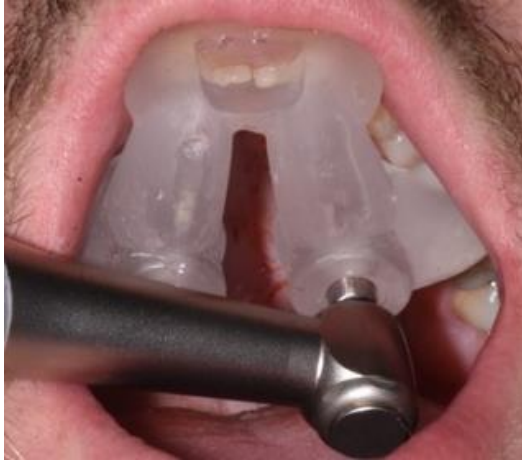
Figure 3: Guided insertion using a pre-fabricated splint