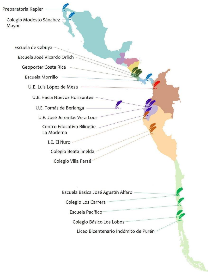
Figure 1: Map of the participating schools to the project “My Story of Plastic Litter: A Journey to the Ocean”