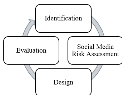
Figure 1. The Adaptive Cybersecurity Training Framework for Social Media Risks (ACSTF-SMR).

Taking Schürmann et al. [20] as our starting point, we propose a training framework consisting of four steps, as shown in Figure 1. Our first step identifies the target audience—employees’ backgrounds are determined here, including their job roles, age, education, work experience, and patterns of social media usage. We will consider the employees’ preferred training methods to ensure our training is adaptable [34].