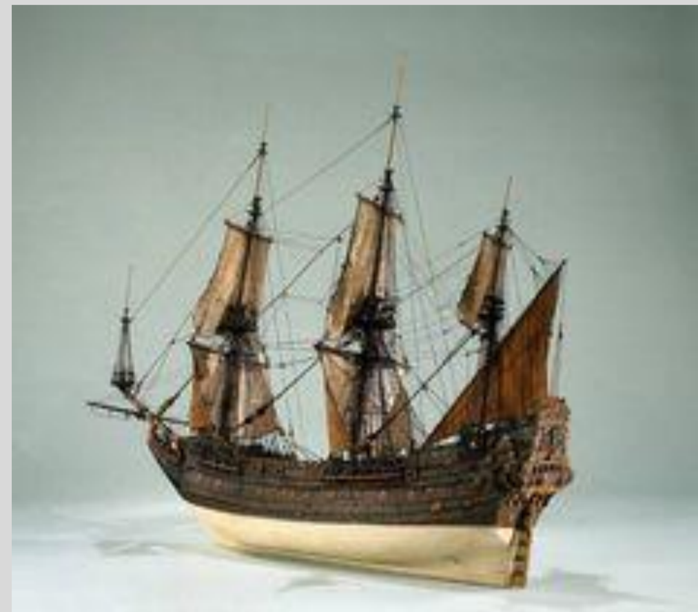
Royal Oak rebuilt at Plymouth Dock 1741, third rate ship of the line, 70 guns

The inhabitants of Plymouth Dock were mainly those working in or for the Royal Navy together with their families and the businesses supplying them, living alongside retired and invalided-out seamen of all ranks. By 1733, in its third decade of existence, the new town had over 3,000 residents with new buildings— commercial properties and dwelling houses- springing up almost daily. By 1780 the population had swelled to 10-12,000 equalling that of Plymouth and by the 1820s it had increased tenfold to 34,000 overtaking Plymouth by a third.