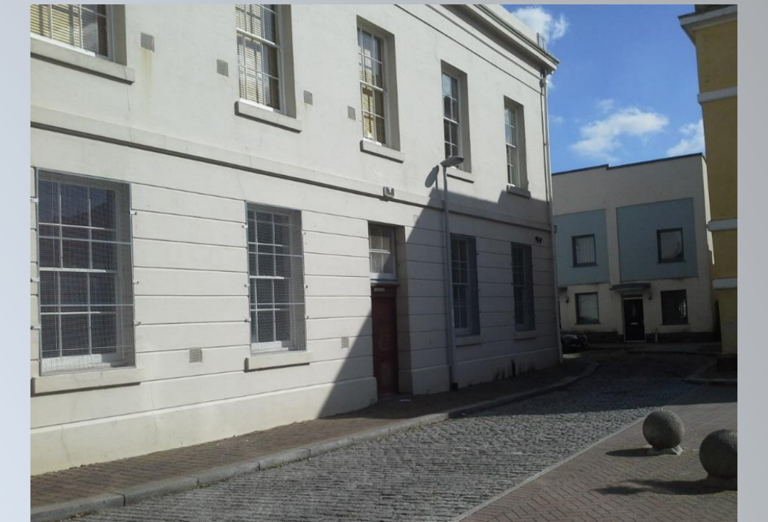
Ker Street Police Station

Devonport Borough Police In 1808 a privately funded force, based on the Thames River police and one of the first of its kind, was established at Plymouth Dock but failed to flourish because of opposition from Plymouth. The Municipal Corporations Act 1835 permitted county boroughs to set up and fund their own police force supervised by the local Watch Committee. In 1838 a new Police Station was built at the rear of the Guildhall, partly as a money saving exercise for local ratepayers. Initially the new Borough force comprised one Superintendent and 12 constables but this expanded rapidly to deal with the burgeoning problems of crime and low level offending and mix of residents, military personnel and visiting sailors. The County and Borough Police Act 1856 restructured many county forces including Devon, but because of its population Devonport kept its Borough force and by 1892 had increased to 59 police officers. Devonport Police. Pay at the time: Inspectors, 23s 4d; Sergeants, 21s; first class constables 18s 1d; second class, 17s 6d; third class, 16s 4d; fourth class 15s 2d (the latter was a probationary class, after 15 weeks constables could be promoted to a higher class.