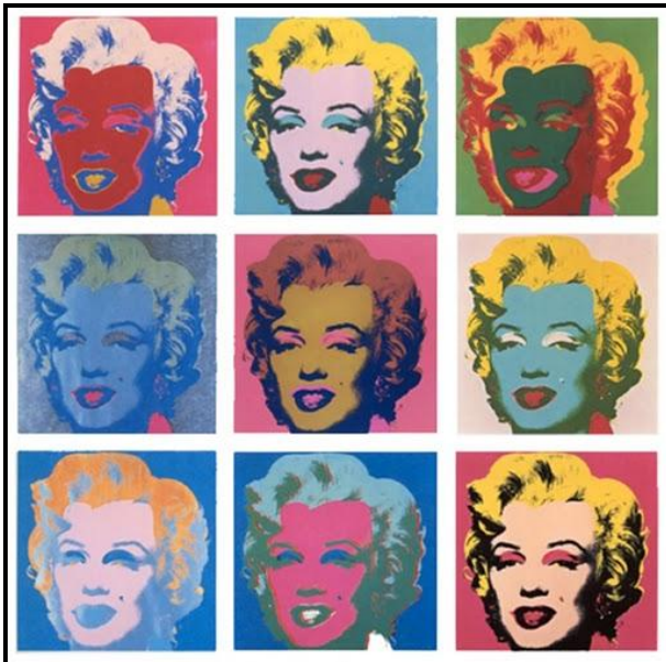
Image 6- 'Marilyn' Andy Warhol (1967). Courtesy of www.awesomw-art.biz . Licensed under Creative Commons Attribution 3 License: http://creativecommons.org/licenses/by-nd/3.0/

Recent interest in rehearsal and repetition in art across history including postmodernist practice is reflected in a growing literature and dedicated exhibitions exploring the topic. 23 Recent interest extends to the use of repetition within works of art where the work itself is either a representation of an existing image or a composite of repeated images or objects with subtle differences between sub-motifs. Such work is common, but not exclusive to postmodern art, where repetition and reinvention act as a critique of the concept of originality on the one hand, but also as a response to high art's notions of authenticity. Sherrie Levine's work serves as a useful example. Levine's series 'After Cézanne' created in 2007 takes features of Cézanne's work and translates them into eighteen similar pixelated abstract images. Levine's Makonde Body Masks of the same year also uses repetition. Here identical bronze casts based on Tanzanian ritual objects hang in a line. Earlier eminent examples of the use of repetition include Warhol's silk screen images. Warhol uses repetition in a number of ways, including the creation of identical replicas, magnification and subtle changes 24 exemplified in works such as his Marilyn prints (see Image 6).