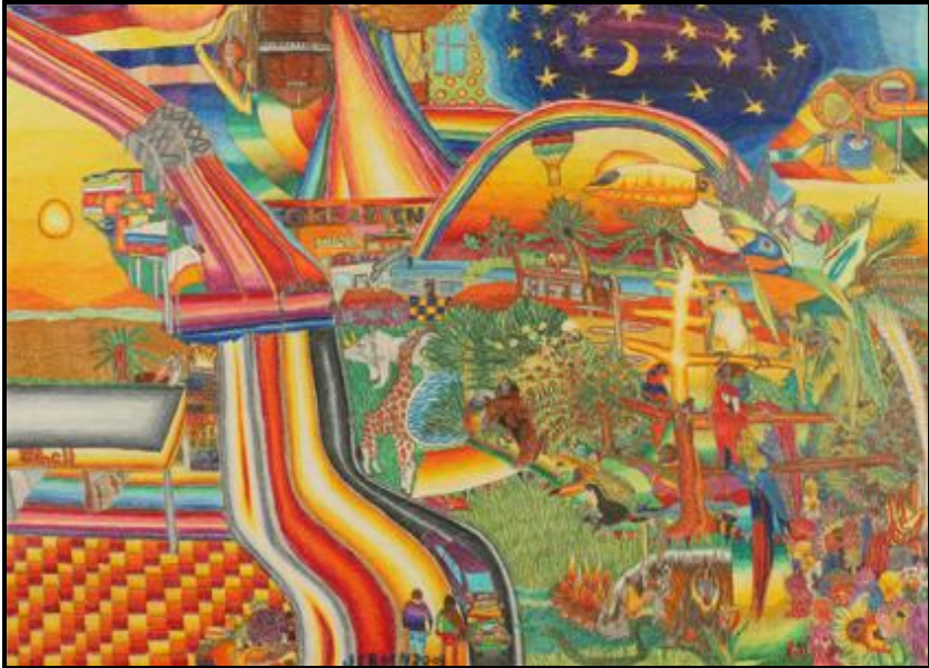
Image 2- ‘Fruit trees with parrots’ Jeroen Pomp (2009).

associated with the Outsider Art Movement demonstrate highly original, imaginative work expressed through a variety of styles ranging from realist to abstract (see Image 2).