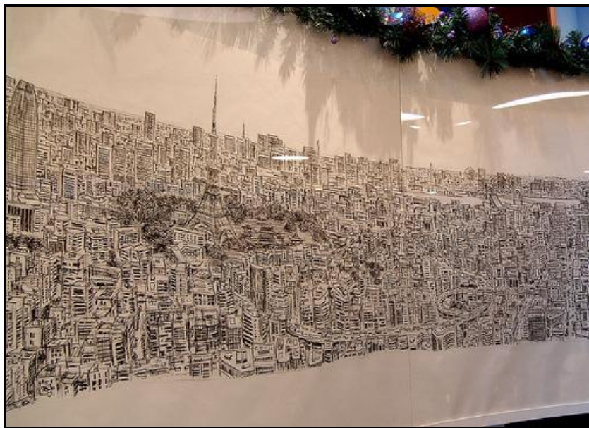
Image 1- ‘Tokya’ Stephen Wiltshire (2005). Courtesy of www.autism.wikia.com . Licensed under Creative Commons Attribution 2.5 License: http://creativecommons.org/licenses/by/2.5/

Stephen creates internationally acclaimed city scenes, has his own gallery in London and is currently exhibiting at the UBS gallery in New York (see Image 1).