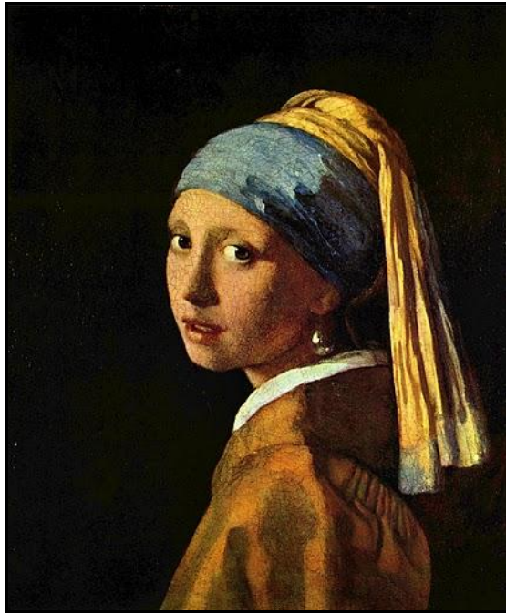
Image 8- 'Girl with a Pearl Earring'. Vermeer (circa 1665). Licensed under Creative Commons Attribution 3 License: http://creativecommons.org/licenses/by-nd/3.0

Returning to our exploration of the creative output of individuals with autism, existing studies also emphasise the attention to detail and elaborative nature of responses to measures of creativity. Such an approach is necessarily in opposition to the rapid and multiple responses required by Torrance-like tests. Here once again, the world of art has a very different take. Artists who obsessively pursue a line of interest may spend years creating one highly detailed work rather than a plethora of solutions to the problem at hand. Masterpieces of this nature are abundant including Michelangelo's David and De Vinci's Mona Lisa. One particularly salient work is the internationally renowned masterpiece 'Girl with a Pearl Earring' by Vermeer (see Image 8). Vermeer's work is characterised by extreme care over long periods of time. Although little is known about the artist it is speculated that even at his most prolific he produced only three paintings during a year and a total of less than 40 pieces as his life time work.