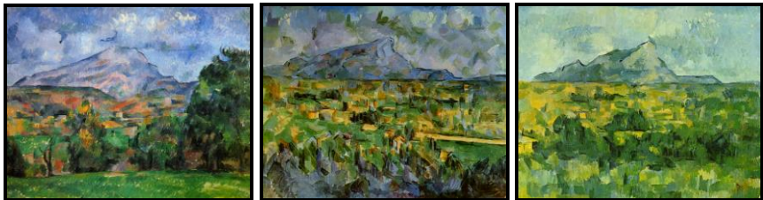
Image 5- ‘Mount St. Victoire’ Cézanne (1902-1906). Licensed under Creative Commons Attribution 3 License: http://creativecommons.org/licenses/by-nd/3.0

Not only does Cézanne demonstrate a highly restricted area of interest, his work also reflects the repeated investigation of a subject matter expressed through a series of images which at least to the untrained eye appear highly similar (see Image 5).