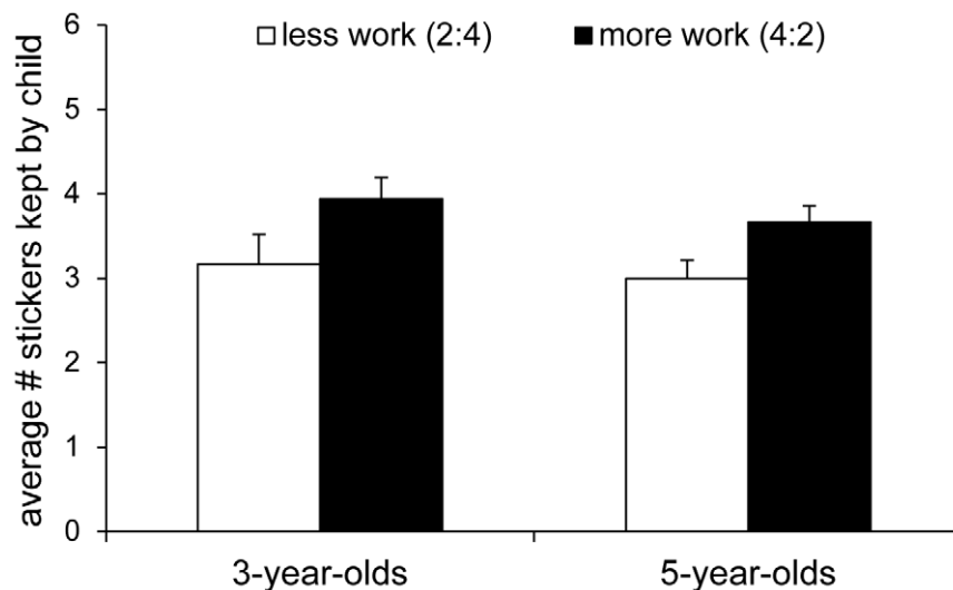
Figure 2. Average amount of stickers that three- and five-year-olds kept for themselves in Experiment 1. Average amount of stickers that three- and five-year-olds kept for themselves in Experiment 1. In the less-work condition (white bars), the child and the puppet retrieved two and four coins, respectively, and in the more-work condition (black bars), the child and the puppet retrieved four and two coins, respectively. doi:10.1371/journal.pone.0043979.g002

Despite the differences in sharing behavior between conditions, it remains unclear whether children actually related their own efforts to their partner's efforts or only paid attention to their own absolute work-effort when sharing rewards (e.g. "I got four coins, hence I get four stickers.>"). In fact, Nelson and Dweck [12] found that four-year-olds only orientated their sharing behavior on their