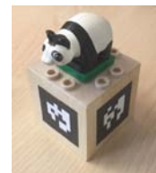
Figure 2. Object with a fiducial marker, which allows it to be identified and tracked.

Fiducial markers look similar to 2D barcodes that can be printed out or displayed on a screen for detection. Several libraries provide 6D tracking of such markers, like the chilitags library [4].