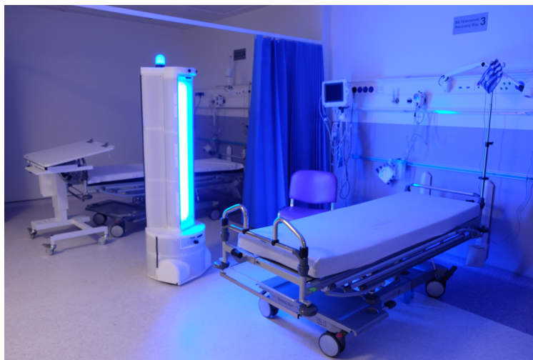
Figure 1: Example of a robotic UVGI platform being used to disinfect surfaces in a hospital.

There are currently no harmonized European or international standards for measuring the efficacy of room decontamination using UVGI technologies. The two most applicable standards are the French norm NF T72-281:2014 “Methods of airborne disinfection of surfaces” and the US norm ASTM E3135-18 “Standard Practice for Determining Antimicrobial Efficacy of Ultraviolet Germicidal Irradiation Against Microorganisms on Carriers with Simulated Soil”. Unfortunately, neither of these standards are suitable for evaluating the microbiological efficacy of mobile UV devices [6], such as that shown in Figure 1. The occupational safety requirements of UVGI is outlined in EU Directive 2006/25/EC, which provides formulae to calculate the maximum effective radiant exposure that a person can be subjected to over an 8 hour period. In the US, UVGI devices are regulated by the Environmental Protection Agency (EPA) as pesticide devices under the Federal Insecticide, Fungicide, and Rodenticide Act (FIFRA). However, unlike with chemical disinfectants, the EPA does not routinely review the safety or efficacy of UV light devices [1].