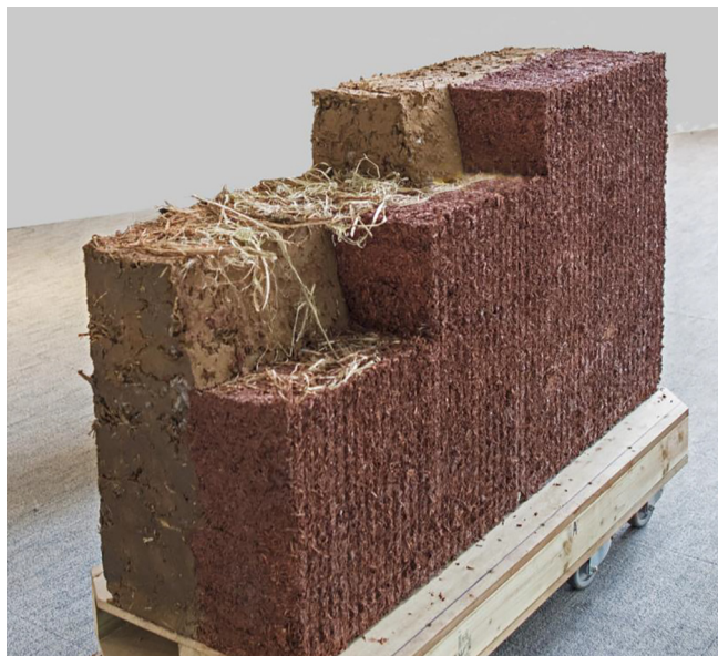
Fig. 5. Photo of one-to-one scale CobBauge wall sample.

and represents the potential for inclusion within a wall construction to meet the thermal building standards.