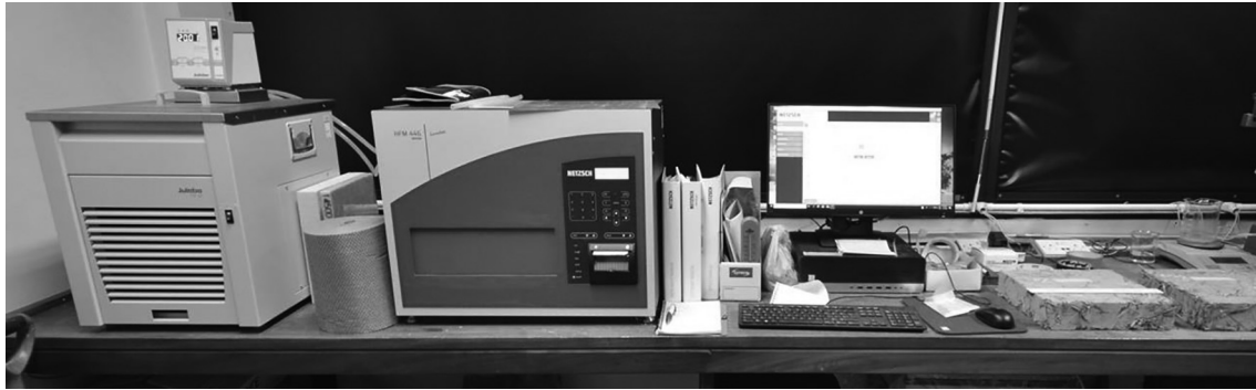
Fig. 2. Heat Flow Meter.

Further analysis using the Atterberg limits [4] found that the liquid limit of UK3 and FR3 is under 50%. This leads to the classifications of “ML”, low-plasticity silt. For soil UK4, the liquid limit was above 50%, giving a classification of “CH”, high-plasticity clay.