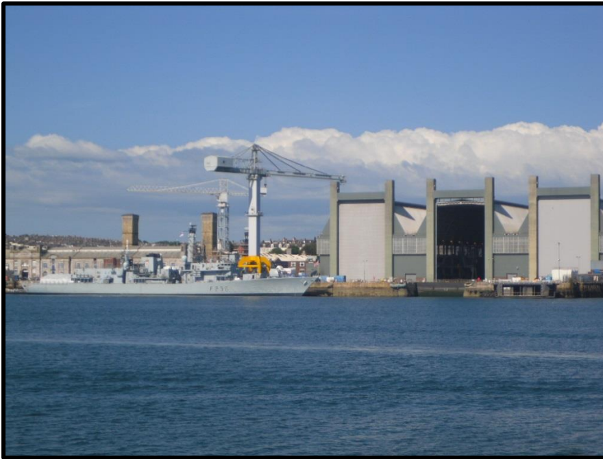
Figure 3: Devonport Naval Base in 2017. HMS Montrose (a Type 23 frigate), the frigate maintenance hangars, and a crane used for servicing nuclear-powered, armed submarines are visible, as are the historic buildings in the North Yard.