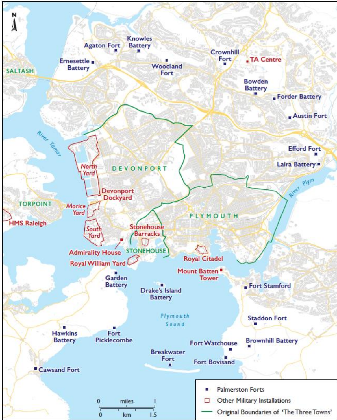
Figure 1: Plymouth: significant military locations, including features mentioned in the text.