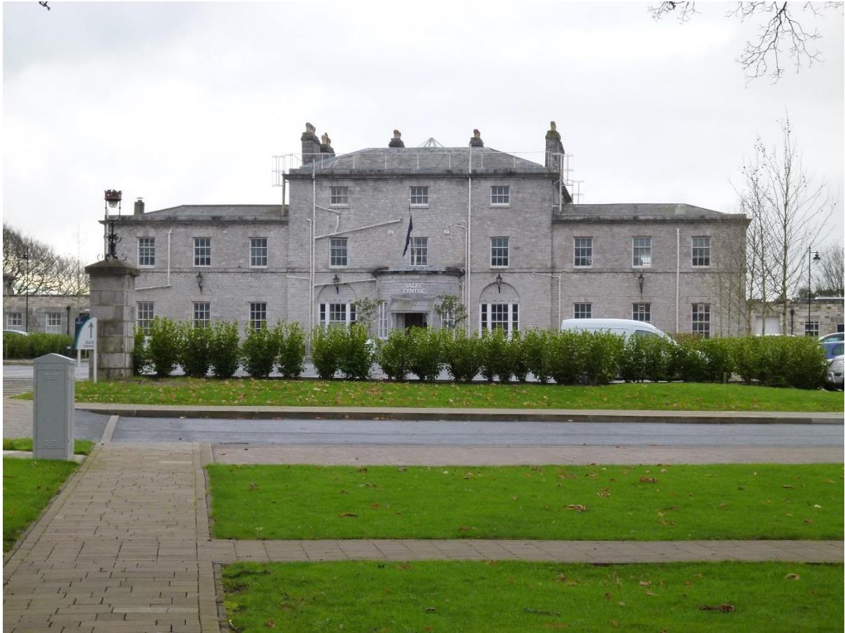
Figure 10: Here at Mount Wise the former Admiralty House has now been converted into apartments.