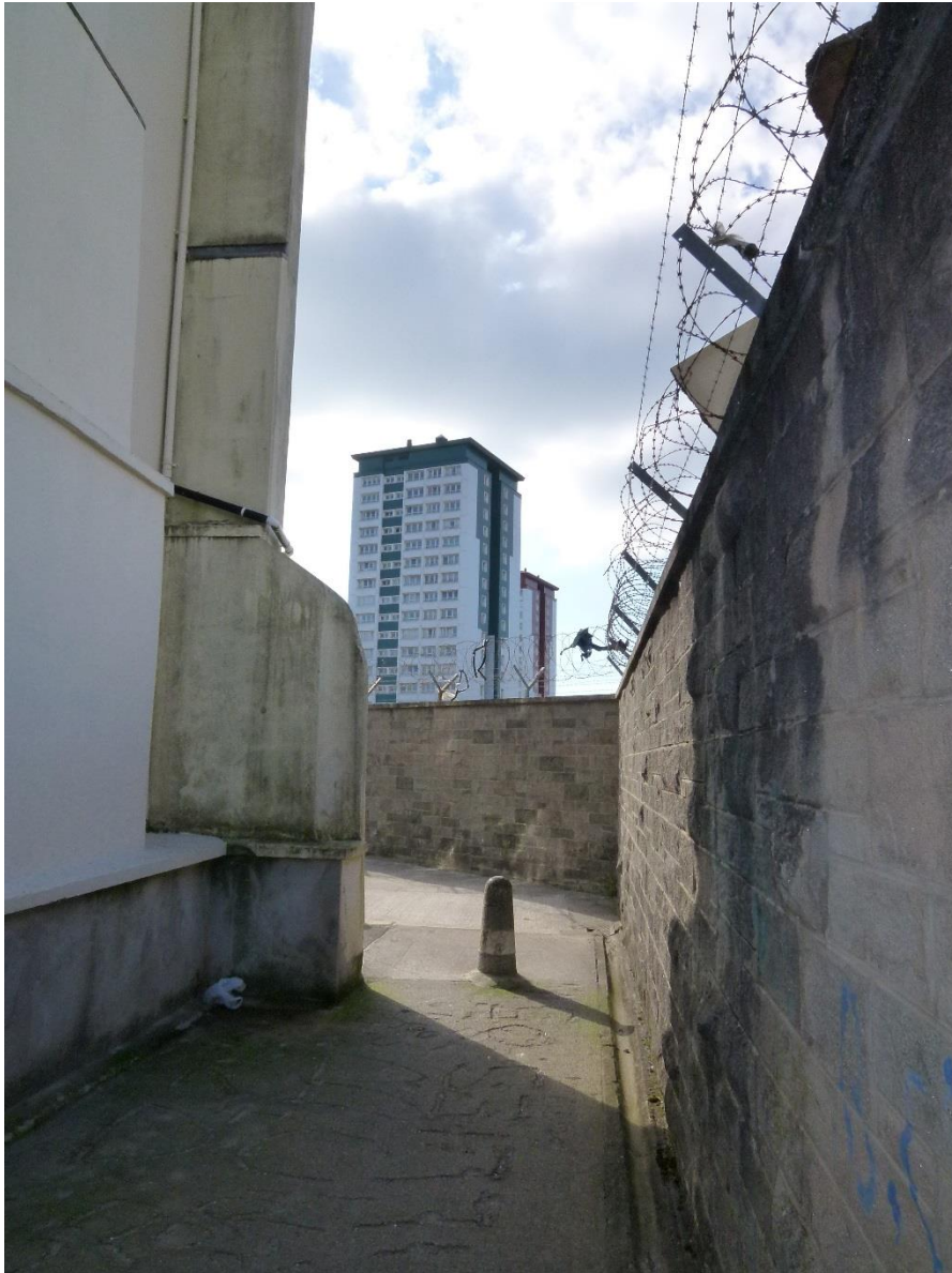
Figure 2: The Devonport Wall, built in 1952 to enclose the naval storage enclave on the former town centre. Here, some of the high-rise flats built to accommodate the displaced population are clearly visible.