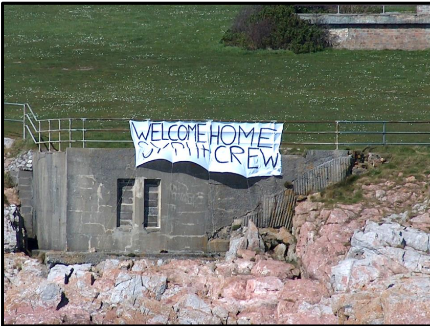
Figure 6: Military geographies and actions are woven into and performed within Plymouth's landscape. Here families welcome home a ship's crew with a banner flown from a former coastal defence battery.