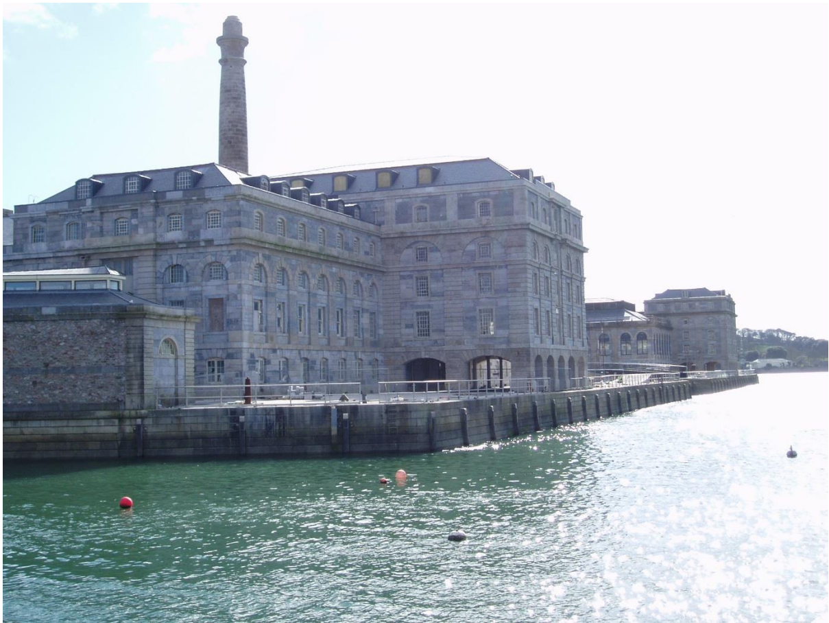
Figure 9: The Royal William Yard’s combination of heritage building and waterfront setting made it a prime site for high-end redevelopment.